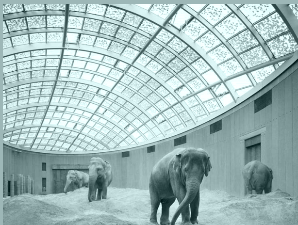
The Copenhagen Zoo, home to Norman Foster's Elephant House