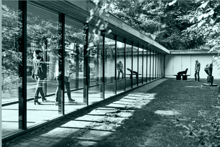
Louisiana Museum of Art

Council members depart for home countries. For those who stay, we recommend: