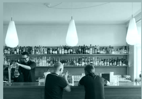
Renovated barfront of Ruby.

Nybrogade 10, 1203 København K, Denmark tel: +45 33 93 12 03