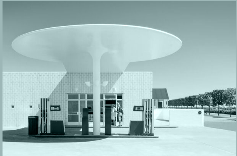
Arne Jacobsen's Petrol Station