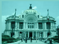
Teatro de Bellas Artes